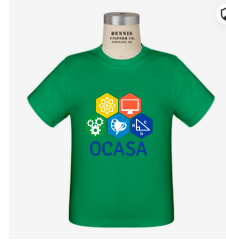
Green Band (6-8)