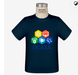
Blue Band (9-10)